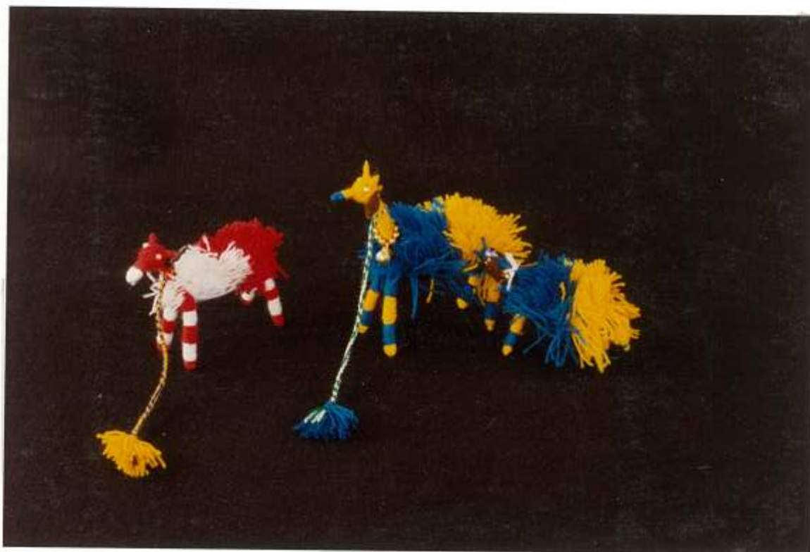
WOOL + WIRE ANIMALS