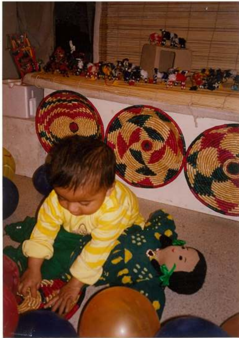
DISPLAY in LOK VIRSA GALLERY ISLAMABAD