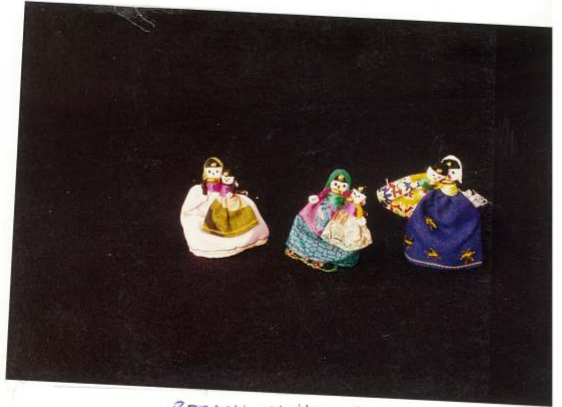
BROACH : Mother + 1