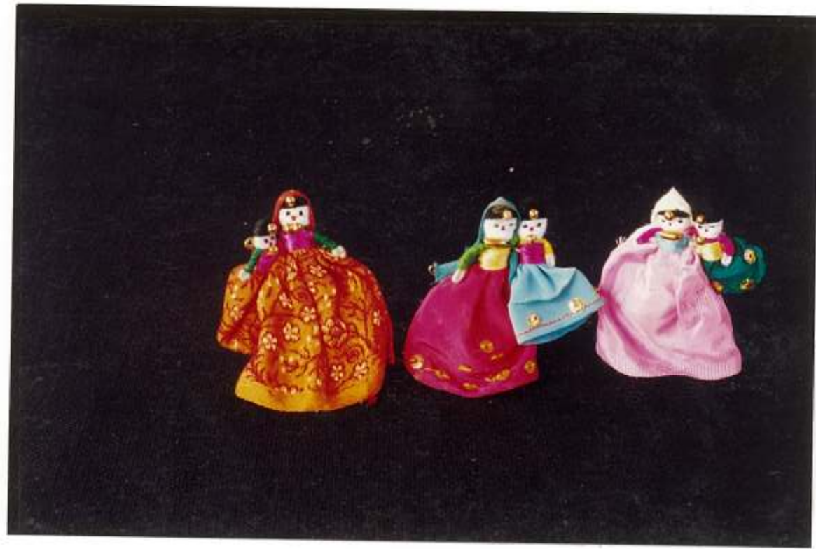
BROACH : MOTHER & CHILD