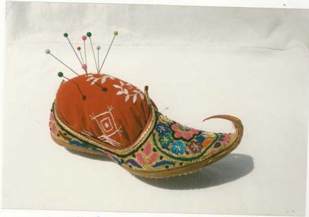
NEEDLE - CUSHION