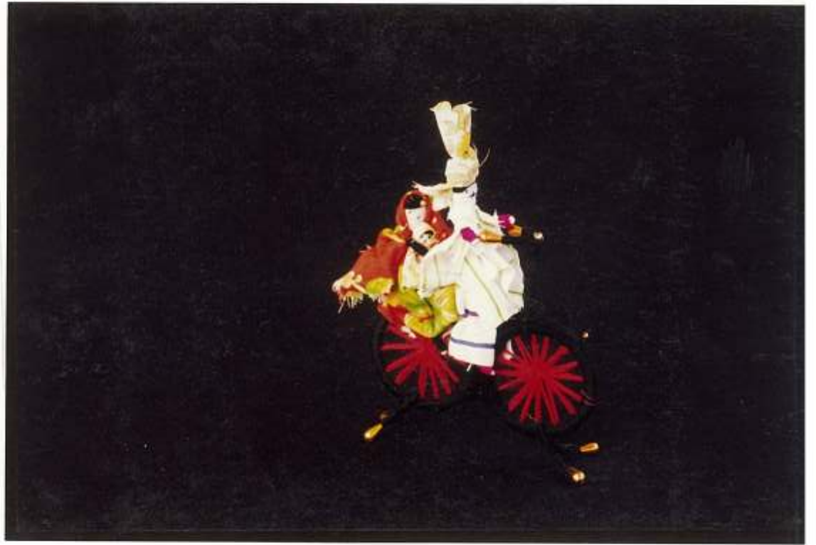
FAMILY ON BIKE