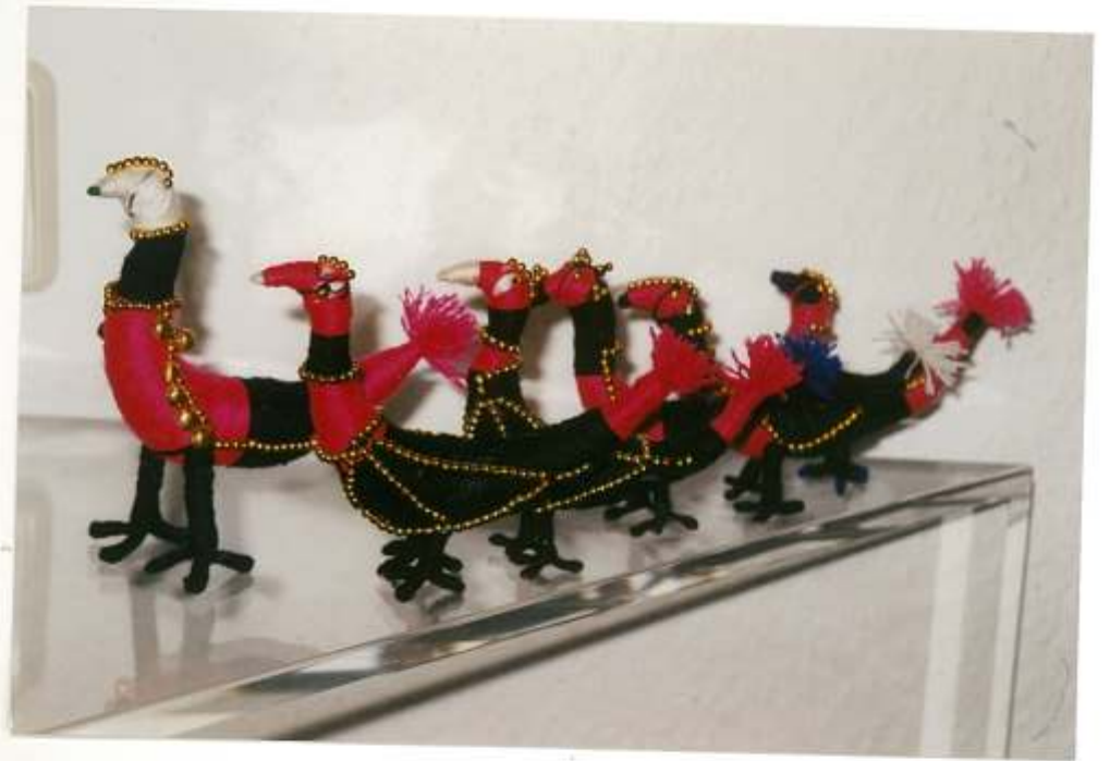
HALIMA - Künstlerin aus CHAK / 2 km von TGD