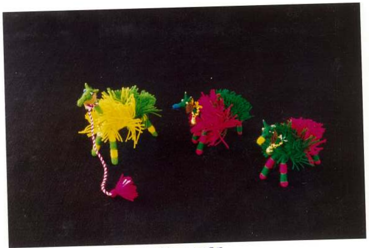
BAKHRI : WOOL + WIRE