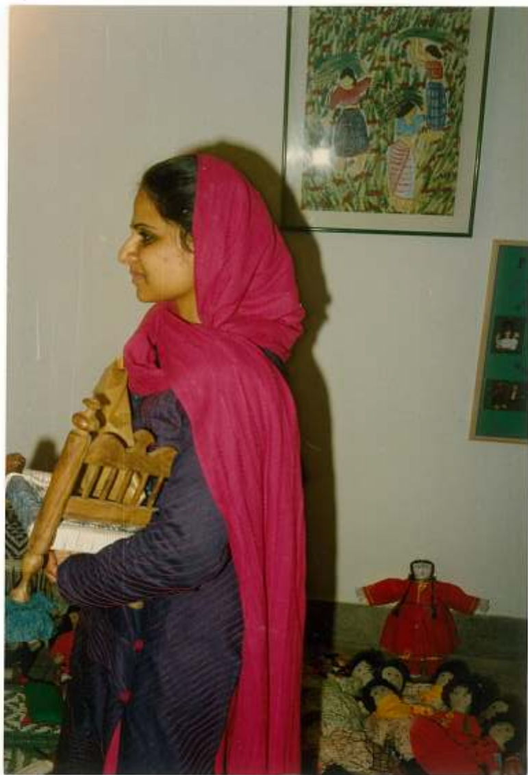
SHISHAM - Puppenstuhl gedreht