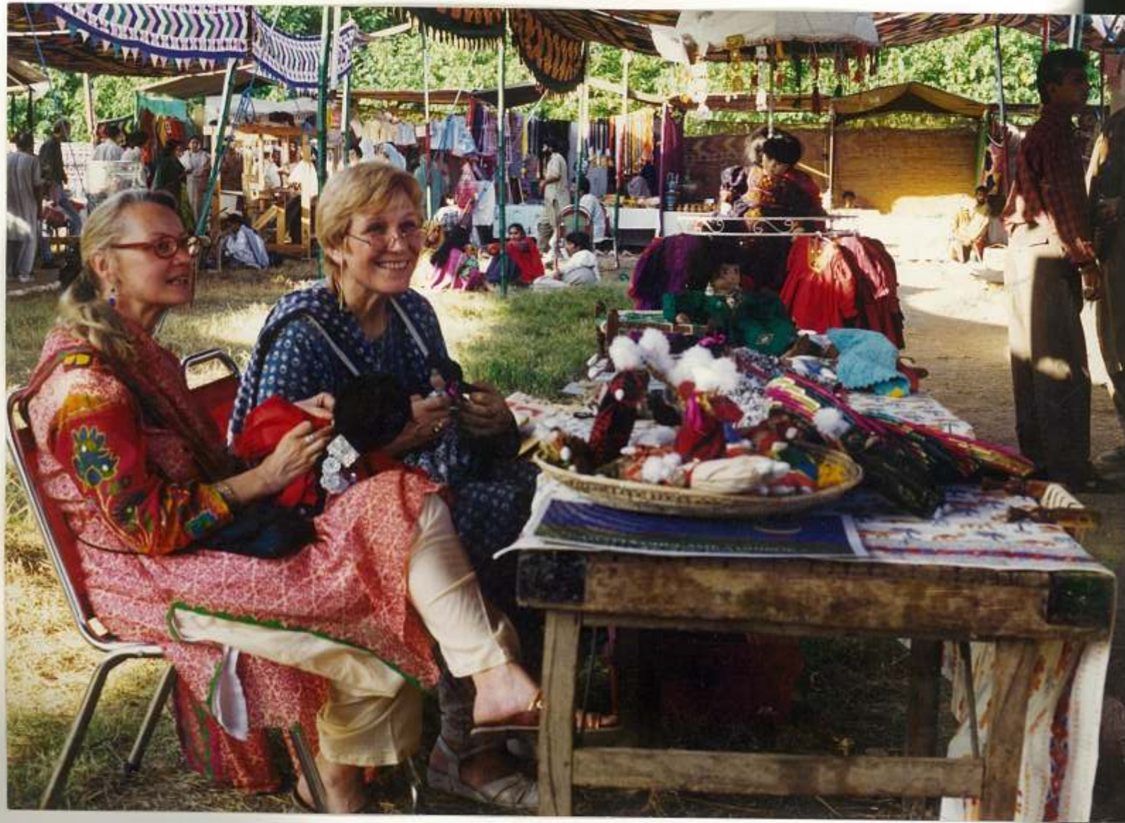
LOK VIRSA MELA - ISLAMABAD - SILLER: standbetreuung