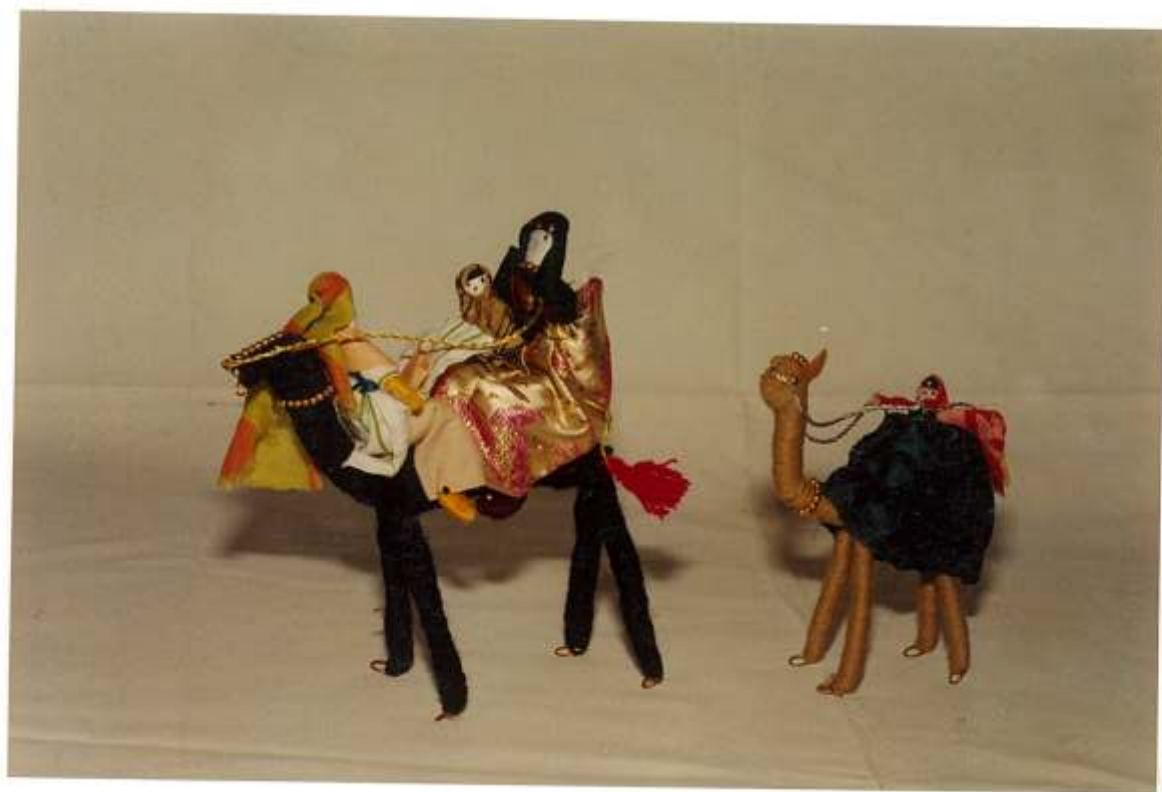
CAMEL · RIDERS